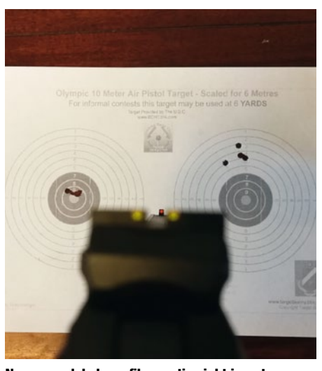
Newer models have fibre-optic sight inserts.