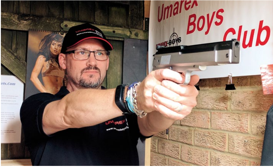
Our club founder with his HW45.

The HW45 is a real hand-cannon in the world of pistol shooting, and I love it. She is one of only a few pistols that I still own from when I started pistol shooting; many have come and gone, but this one's a keeper. Mine has a two-tone silver body with a black top, and she looks good wrapped in Hogue rubber. She isn't small and in no way the prettiest, but you have to treat her like a lady – no tight squeezing, or she will kick back. A