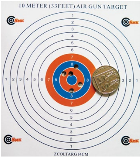
Eric's first five shots on target.