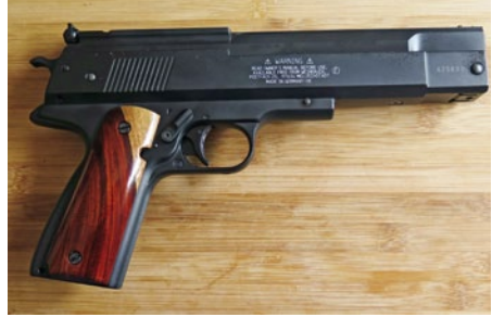
Kevin's HW45 wears chequered wooden grips.