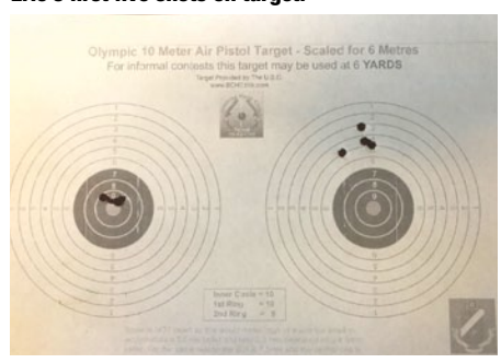
Left shows two-handed; right was one-handed.