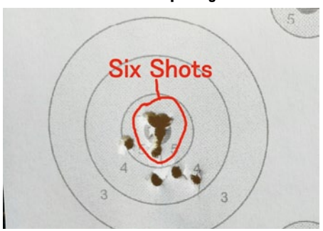
The heart of the group was dead centre.